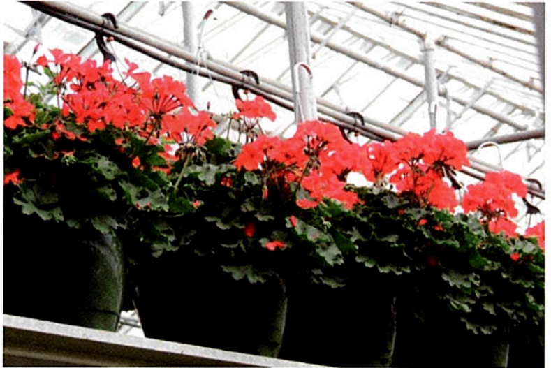
'Caliente' Series Pelargonium

'Caliente' geraniums are beautiful en masse for a low maintenance pop of color in full sun to part shade. They also combine well with other heat-loving annuals like lantanas and annual vincas, and they are not container thugs that take over a pot when mixed with other plants. ✂